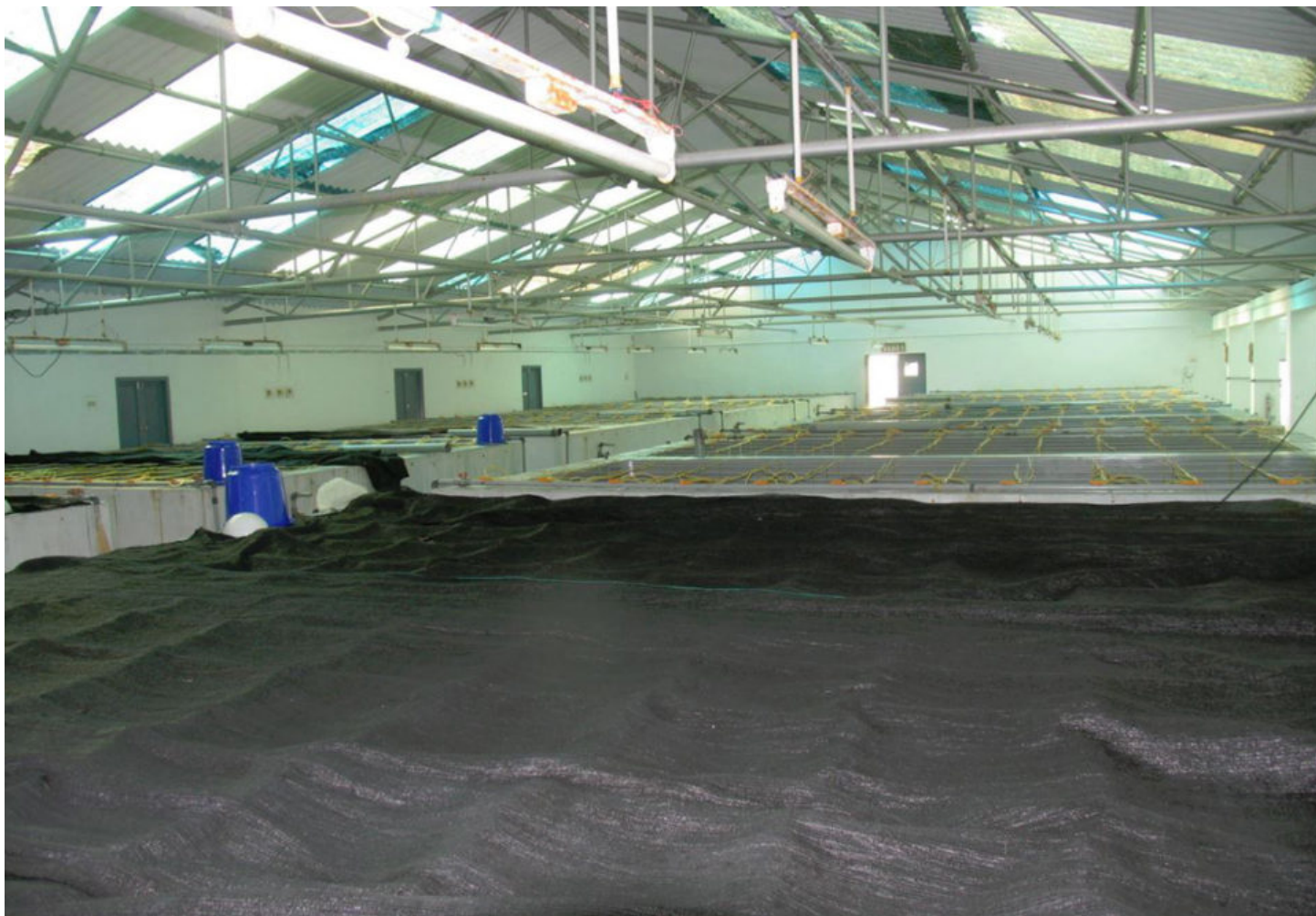
View of larval production tanks for P. vannamei at an Indian shrimp hatchery. The zoea-2 syndrome has caused larval mortalities in several hatcheries.

Editor's note: This is part 3 of a three-part series. Read part 1 here and part 2 here .