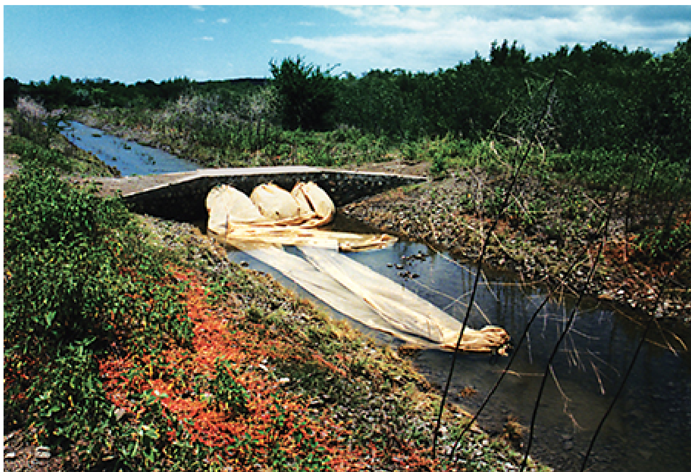
Incoming water flowed through a series of filters to eliminate hosts that could harbor shrimp viruses.