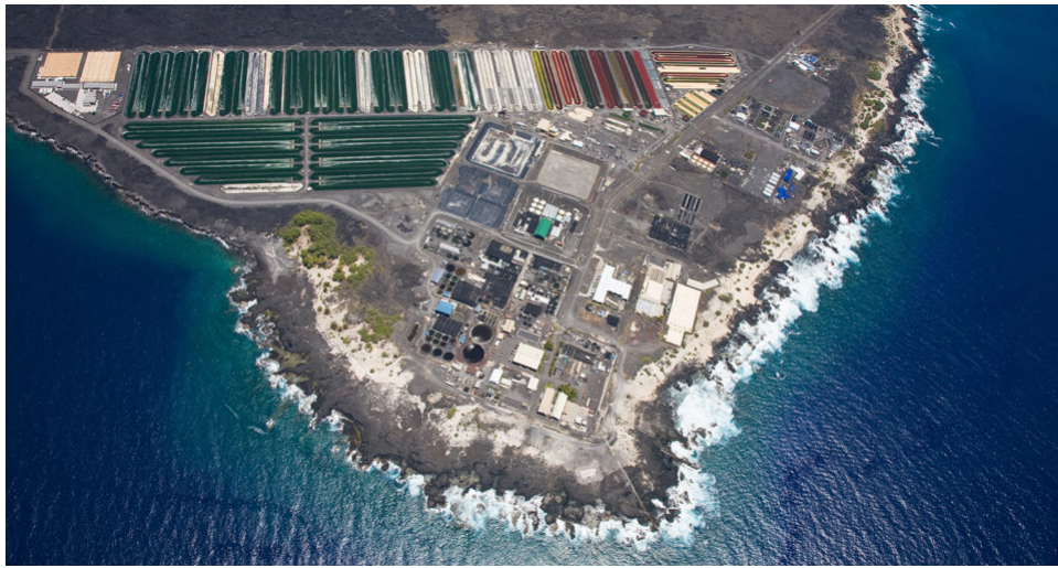
An aerial view of the National Energy Laboratory of Hawaii (NELHA) in Kona, Hawaii.