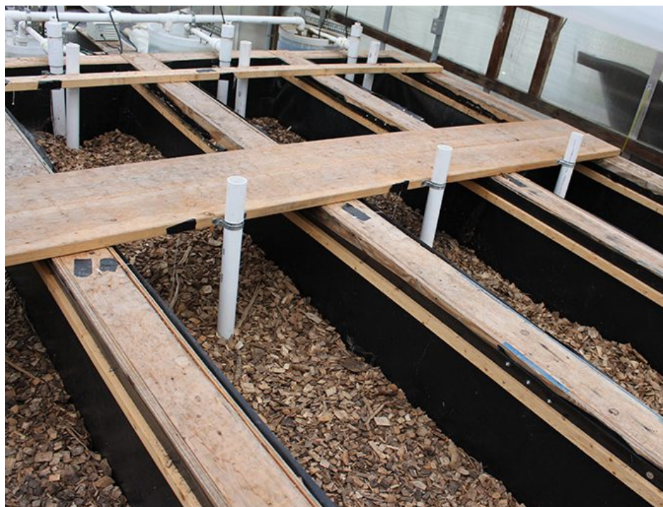
Four experimental pilot-scale denitrification woodchip bioreactors, located at The Freshwater Institute in Shepherdstown, West Va., USA. The bioreactors here are sized to be 1/10 scale of a field reactor.