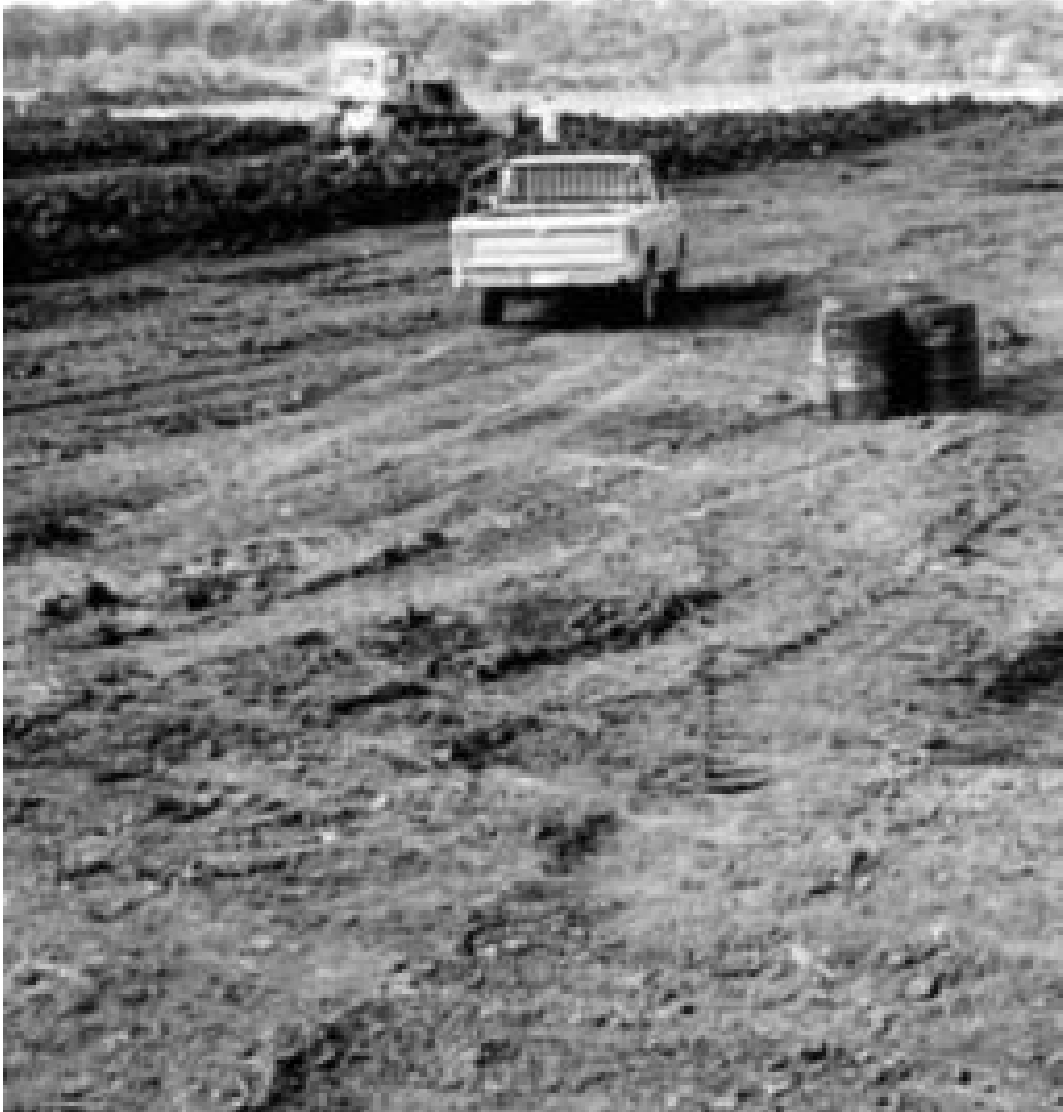
Embankment ponds are made by digging soil from the bottom to build up levees.

Inland pond aquaculture usually has a greater effect on local hydrology than other types of aquaculture, because water may be removed or diverted from natural water bodies for filling ponds and maintaining water levels.