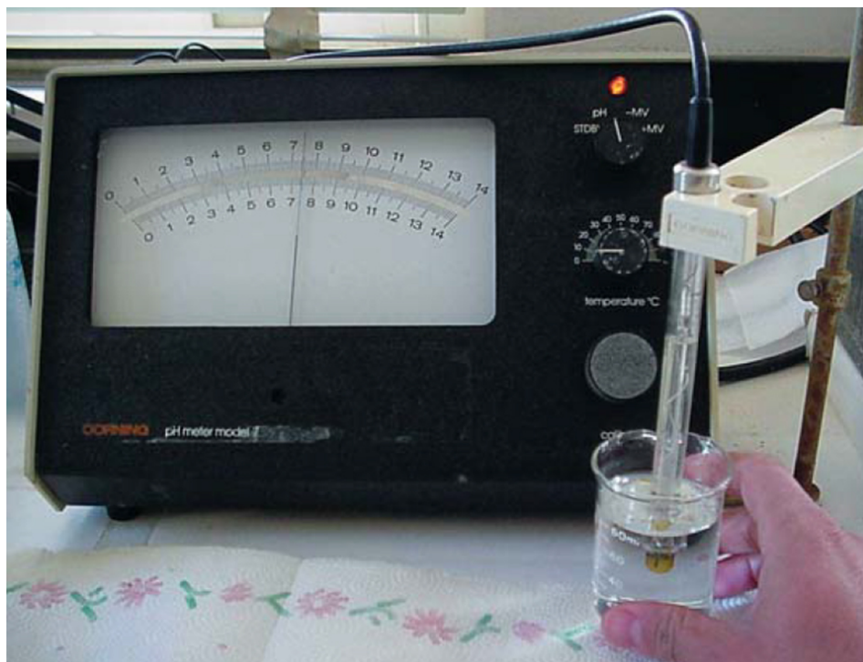
Fig. 2: The only reliable way of measuring pH is with an electronic pH meter.

A pH meter must be standardized before making measurements. Although it is customary to use a pH 7 buffer to standardize a pH meter, this procedure is not always reliable, for almost any pH meter can be adjusted to pH 7.0. The meter can be standardized at pH 7, but a second pH buffer one or two pH units above or below pH 7 should also be used to verify the meter will read another pH correctly after being standardized.