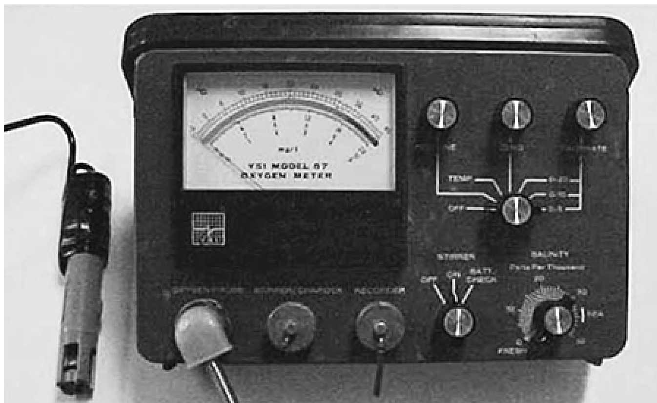
Fig. 2: Polarographic dissolved oxygen meter and probe. Since the connection between the cable and probe tends to wear, this probe is taped for greater longevity.