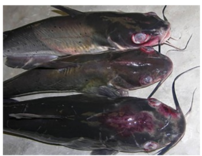
Typical clinical signs of virulent A. hydrophila infection in channel catfish.

Since 2009, outbreaks of motile Aeromonas septicemia (MAS) in West Alabama and East Mississippi have cost U.S. catfish aquaculture an estimated $60-70 million due to mortality, lost feeding days and costs associated with chemical and antibiotic therapy. Emerging virulent Aeromonas hydrophila (vAh) was demonstrated to be responsible for the MAS outbreaks (Figure 1). To date, primary or obvious field conditions leading to the disease outbreaks are largely unknown and suggested management practices have failed at limiting or preventing the outbreaks.