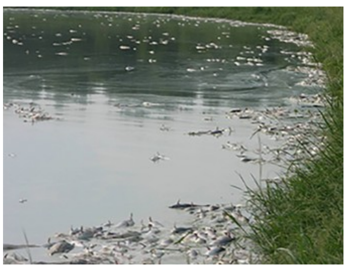
Virulent A. hydrophila outbreak in a west Alabama catfish pond.

The following treatments were conducted to assess effect of netting and wounding of fish on mortality: 1) Light transfer and holding: Fish were transferred from the stock tank to the 50-L experimental tank (10 fish/tank) using an 8-inch (20-cm) net. Forty-eight hours post transfer, water flow was turned off and the tank water level was reduced to 15-L. Fish were challenged with vAh at concentration of 2.0\pm0.06 \times 10^7 cfu/mL of tank water. One-hour post challenge, water flow was resumed. There were 6 replicates for A. hydrophila challenge and 3 for mock challenge (by adding 100 mL of uncultured TSB); 2) Skin abrasion: Fish were lightly transferred in the same way as described in Treatment 1 to a bucket filled with about 20-L of tank water containing 100 mg/L of tricaine methanesulfonate (MS-222). Individual immobilized fish were lightly abraded on one side of the tail (crossing about 2.0 - 2.5 cm) using a 4-ct Scour Pad.