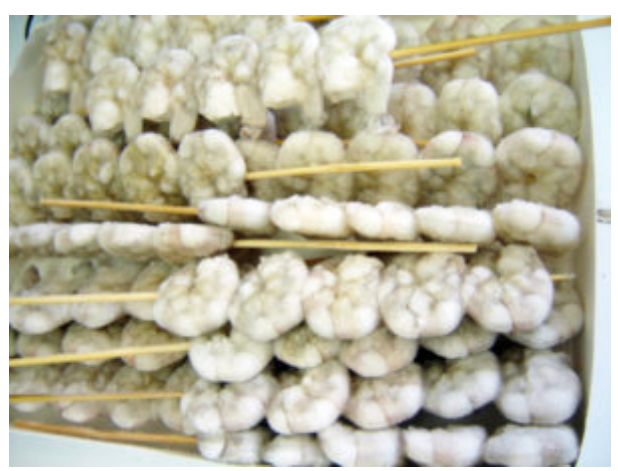
Shrimp skewers have become an increasingly common – and convenient – item at restaurants and supermarkets.

Value-added seafood can be defined in different ways. For example, a shrimp farmer can peel a percentage of his crop that is soft-shelled and thus increase its value, rather than decrease income by having to sell the shrimp as a second-grade product.