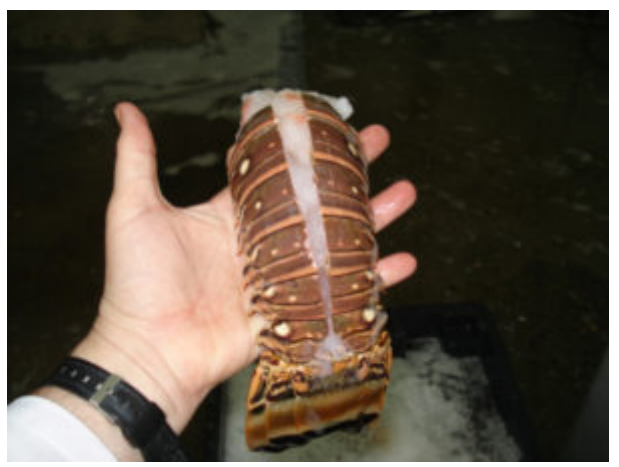
Lobsters can also be value added. Spiny lobster tails are often sold with a split back to aid removal of the meat.

Because the current U.S. antidumping tariffs do not affect value added products, this classification of exports to the U.S. has increased in recent years. Countries like Ecuador, China, and Thailand have shifted much of their production to value- added products.