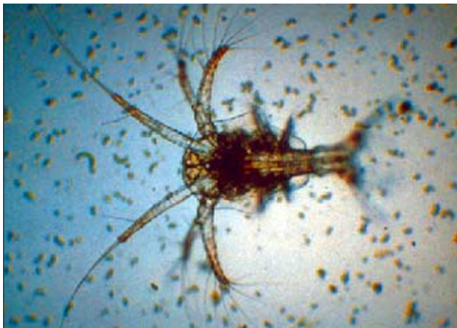
Penaeus vannamei zoea and rehydrated Spirulina .

highest possible amounts of these substances. Spirulina can vary in amounts of phycocyanin, and a source with at least 10 percent phycocyanin content should be used.