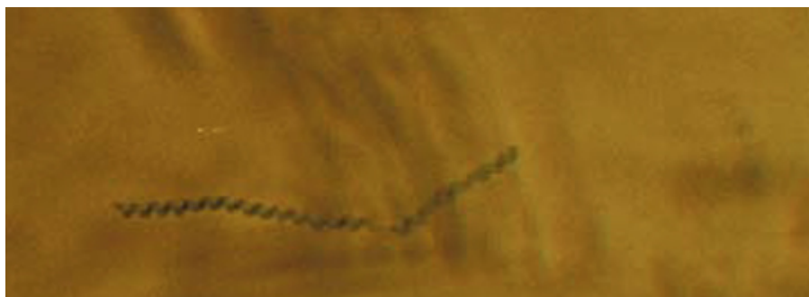
Marine Spirulina .

Best results are achieved when Spirulina is used in combination with fat-rich, live algae like diatoms. Spirulina powder is very rich in protein and vitamins, but does not contain enough fat for growing larvae. Fat-rich diatoms, together with dried Spirulina , can form an ideal diet that results in very strong postlarvae. Dried Spirulina may be used at each feeding, or the hatchery operator may want to