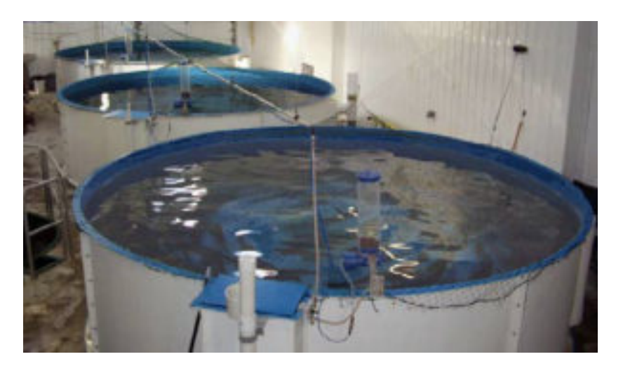
Subadult salmon are temporarily held in a research building.

The program is currently culturing salmon from four consecutive year classes. Typically, eggs are disinfected upon arrival and incubated in separate hatching jars. After initiation of feeding, fish densities are equalized in 0.15-cubic-meter parrrearing tanks and evaluated for early growth traits.