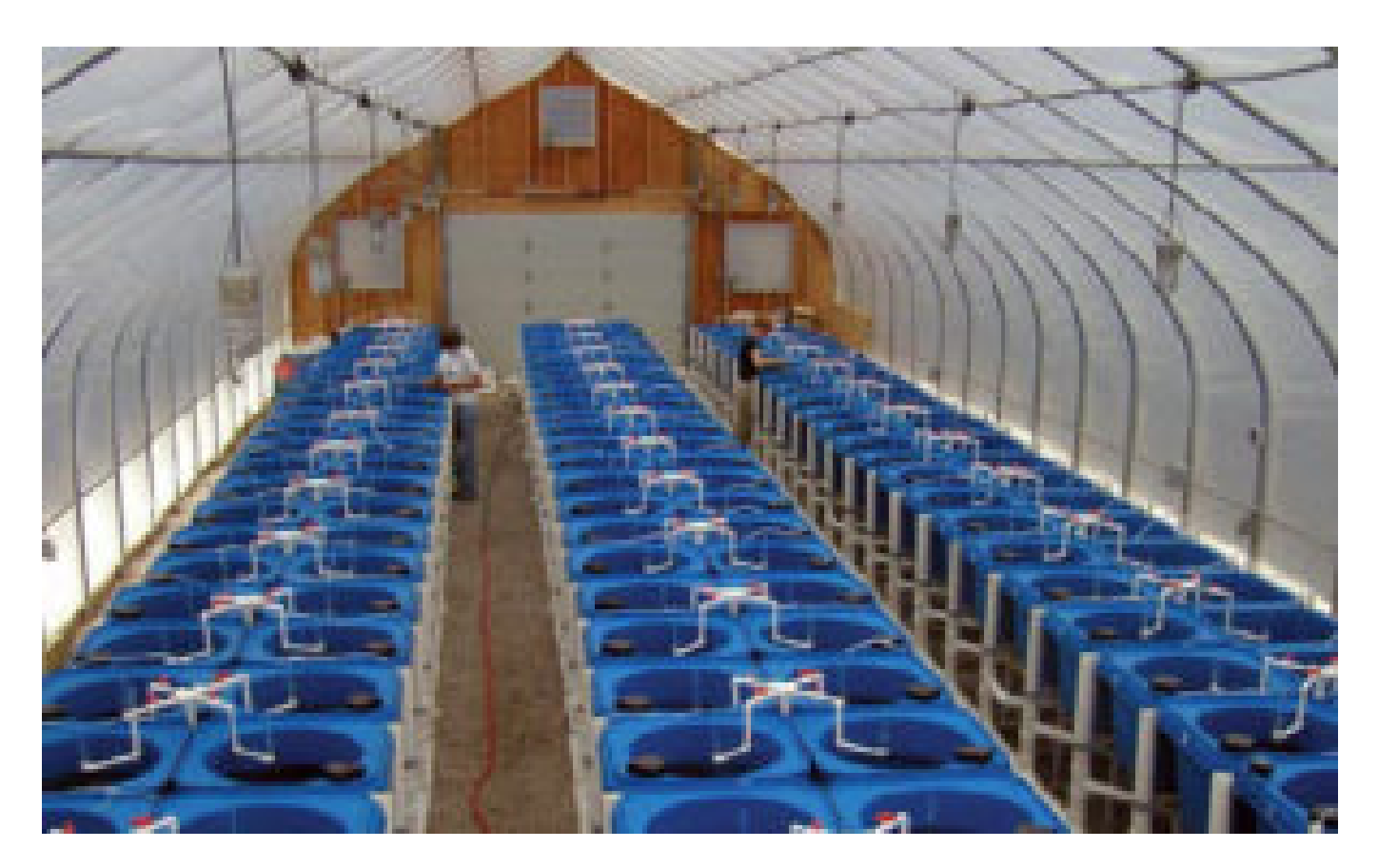
Recirculating systems in greenhouses were temporarily used to culture young salmon prior to the completion of permanent facilities.