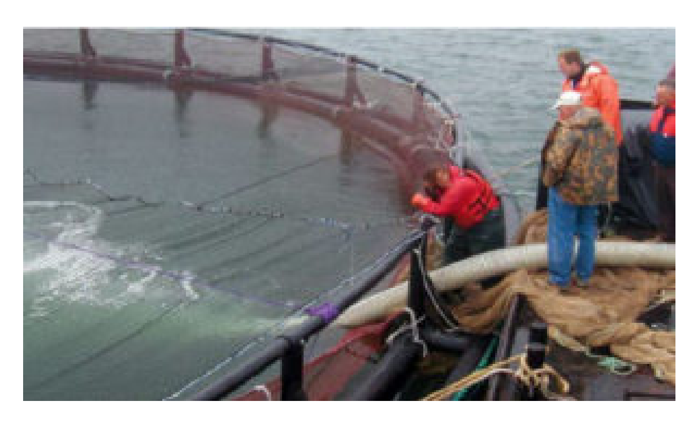
USDA and industry personnel stock smolts from the research program into commercial net pens.

tagged and vaccinated at 20 to 40 grams and stocked into 9-cubic-meter smolt tanks. Smolts are then stocked into sea cages in cooperation with industry partners and evaluated for growth, survival, and sexual maturity under commercial situations.