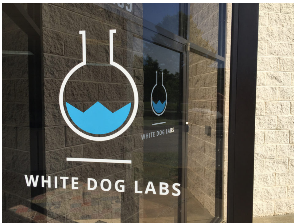
White Dog Labs is based in New Castle, Del., USA.

"It was a very positive, encouraging response we saw," said Dumas.