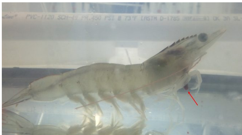
Shrimp consuming a manufactured feed pellet.