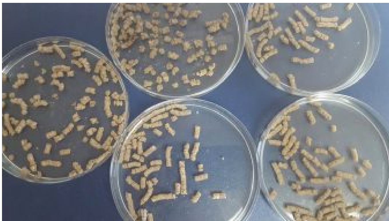
Extruded feed pellets (longer ones, on bottom and right) maintain their hydrostability longer than pelletized ones, and have a softer, more pliable texture.