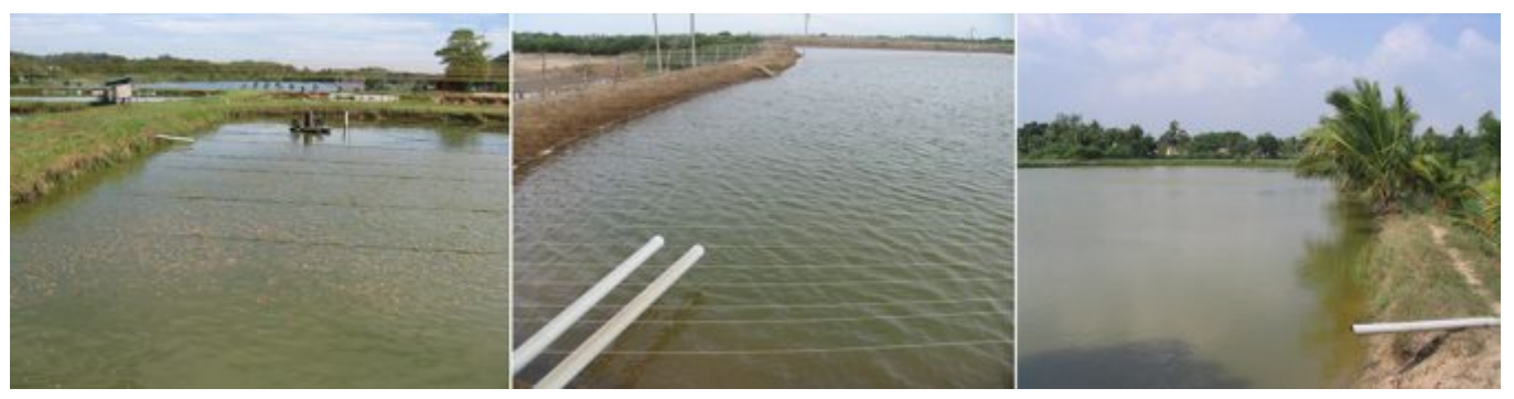
Extensive aquaculture of tilapia involves small, earthen ponds with relatively low levels of inputs and management.

In the progression from low to high management intensity, tilapia production systems can be described as extensive, semi-intensive and intensive, each characterized by a distinct change in the level of investment, operating costs, degree of management input, control, risk and yield.