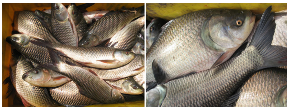
Indian carps like rohu ( Labeo rohita , left) and catla ( Labeo catla , right) are among the main fish species farmed in India.

A combination of Indian major carps – including catla ( Labeo catla ), rohu ( Labeo rohita ) and mrigala ( Cirrhinus mrigala ) – were used as the main target species for culture, as well as a few Chinese carp species like silver carp ( Hypophthalmichthys molitrix ), grass carp ( Ctenopharyngodon idella ) and occasionally common carp ( Cyprinus carpio ). The very high level of technology developed for induced breeding of carps and the abundance of agri-byproducts used as supplemental feed led to the rapid development of freshwater aquaculture in the country.