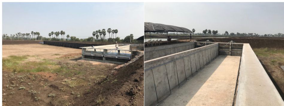
View of in-pond raceway system (IPRS) units under construction in India. These systems combine the biological benefits of a pond-based system and the mechanical water flow benefits of a recirculation system.

In addition to the pond and cage-based systems, India can also adopt many other modern systems that can significantly increase production and at the same time conserve water, land usage, optimize inputs such as feed, power, fuel and other inputs. The in-pond raceway system (IPRS) is currently being tested out in India and the South Asia region by the U.S. Soybean Export Council (USSEC) to evaluate its economic suitability. IRPS merges the biological benefits of a pond-based system and the mechanical water flow benefits of a recirculation system.