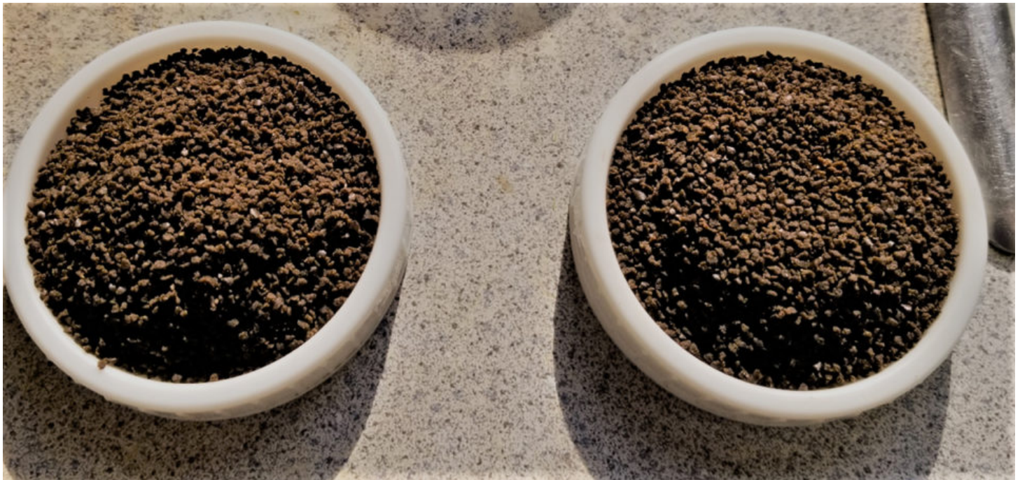
Fig. 1: Untreated diet (left) and the experimental diet coated with methyl anthranilate (right) – both diets looked identical except for the strong grape smell of the latter.