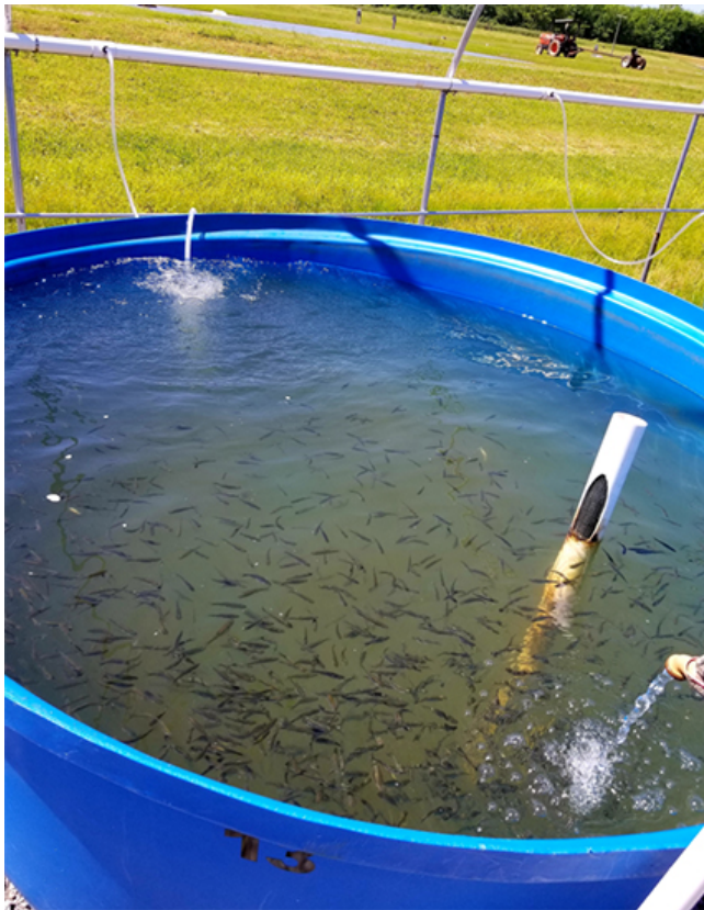
Fig. 2. Golden shiners were maintained in 2,000-liter flow-through tanks.

Two diet treatments were used in quadruplicate; one control group of golden shiner juveniles was fed a commercial untreated diet and another group fed the same diet tumbler-coated with 4 ml/Kg (MA/feed) (Fig. 1).