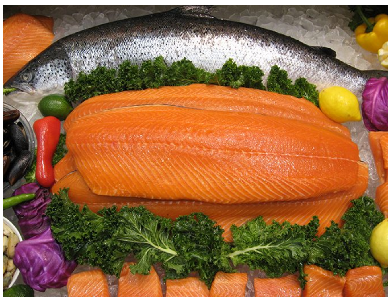
Farmed salmon is an important seafood product and popular with many consumers around the world.

It is natural to ask to what extent this represents inherent differences between the taste buds of Americans and the other countries, or to what extent there are opportunities for manipulating the flavor of salmon products in processing and cooking stages to improve taste perceptions. One of the co-authors has anecdotal evidence from the United States that overcooking of salmon tends to affect the flavor of salmon in a significantly negative direction.