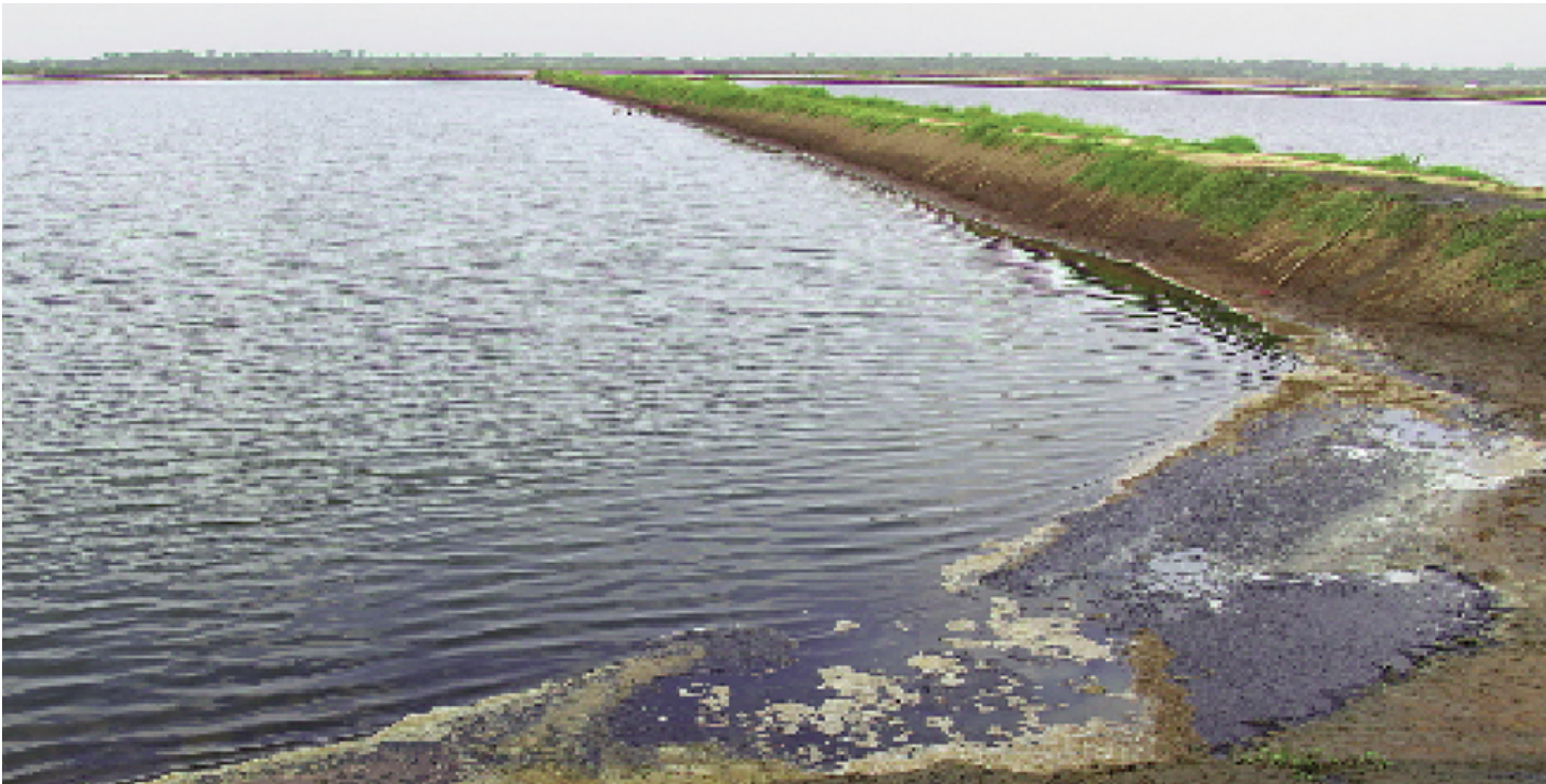
The best approach to avoiding hydrogen sulfide problems is good management of pond bottom soil and water quality.

Hydrogen sulfide is extremely toxic to fish, shrimp, and other aquatic organisms. Shrimp and other crustaceans possibly are more tolerant to hydrogen sulfide than fish, but few data are available to confirm this. The ionic forms of sulfide are not as toxic as hydrogen sulfide, whose concentration can be estimated for the appropriate pH and water temperature (Table 1).