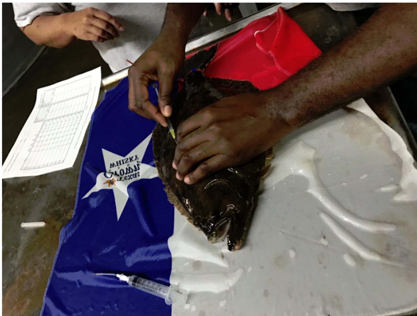
Hormone injection into an anaesthetized female adult Southern flounder.

Females are graded prior to hormone injections. Females identified as being at Stages 3 or 4 are injected with gonadotropin-releasing hormone. The hormone is injected into the muscle between the lateral line and the dorsal fin at a dosage of 50 to 100 µg/kg (Fig. 1). About 48 hours after injection the strip spawning procedures may begin.