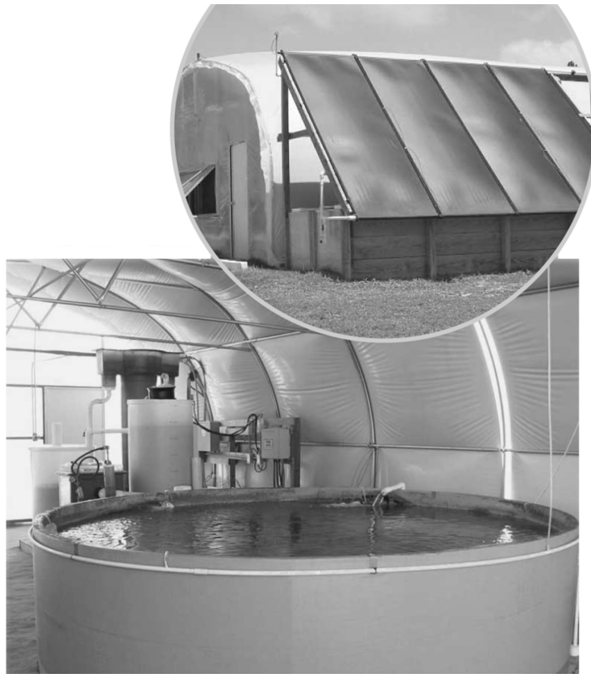
Solar panels were mounted above insulated reservoir tanks adjacent to the greenhouse.

Florida State University researchers, in collaboration with the United States Department of Agriculture Agricultural Research Service and Harbor Branch Oceanographic Institution, are evaluating whether off-the-shelf flat-plate solar collectors can maintain stable recirculating aquaculture system (RAS) temperatures and if it is cost-effective to do so. Well-designed recirculation systems could be ideal for maintaining elevated production temperatures, due to far less heat loss than flow-through or outdoor systems.