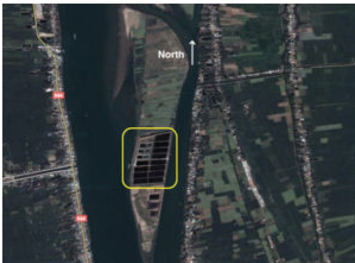
The QVD Aquaculture farm is located on an island in the Mekong River.