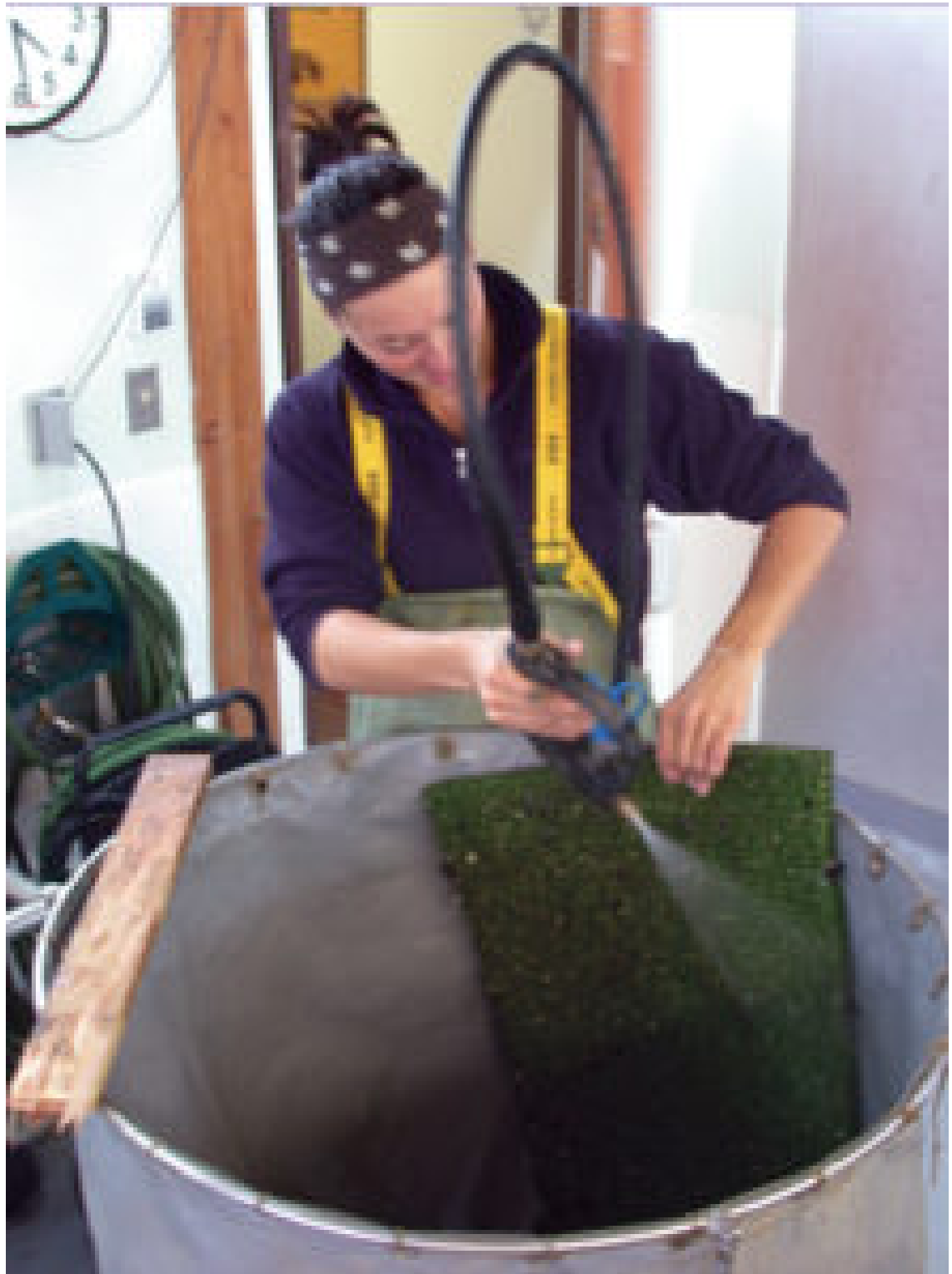
Small clams and other organisms are removed from mats with pressurized tap water.

On one hand, clams would reach larger sizes when mats are retrieved later. Further, the increase of spat size with time could possibly result in higher numbers being trapped between the mat bristles. On the other hand, there could be higher risks to loose spat from the mats during fall due to the turbulence associated with the higher frequency and intensity of the storms at this time of year.