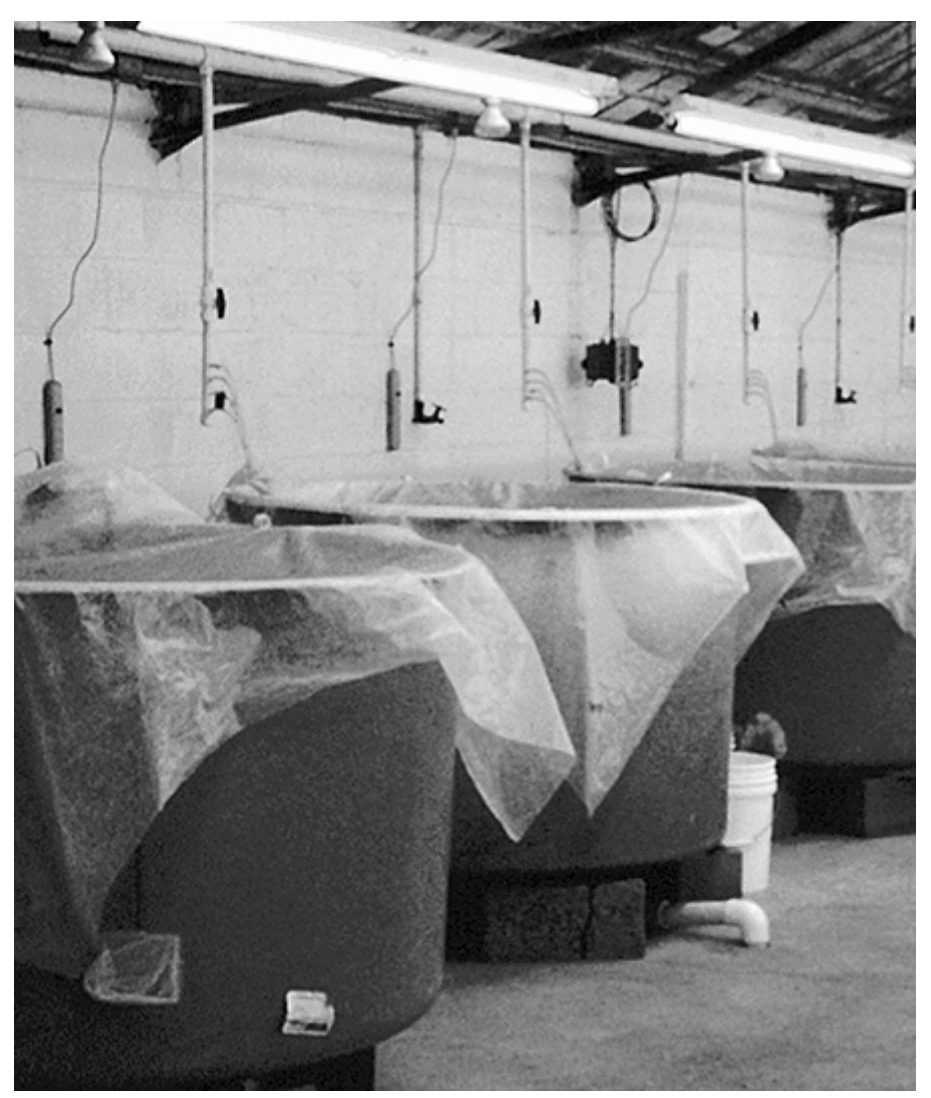
Selectively bred shrimp were maintained in 1,000-liter fiberglass tanks containing artificial seawater.

In 1999, significant mortalities of a Taura Syndrome Virus (TSV)-tolerant strain of the Western blue shrimp (Litopenaeus stylirostris) occurred at shrimp farms in Mexico. These mortalities resulted from TSV epizootics accompanied by a slight deviation in the gross signs typical of TSV infection, and there were concerns a new TSV strain had emerged.