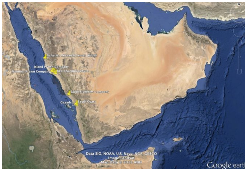
Fig. 1: Locations of shrimp farming facilities in the Kingdom of Saudi Arabia.