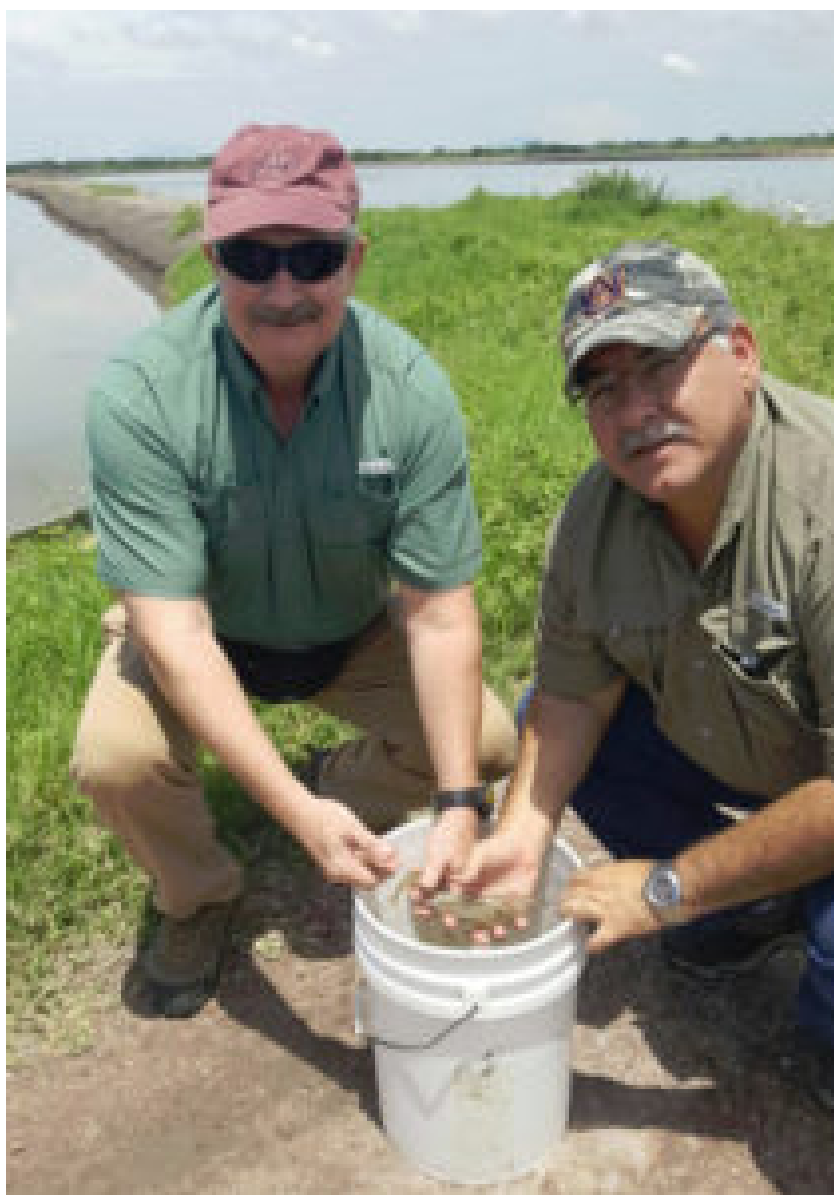
Authors during recent visit to shrimp farm in Central America.