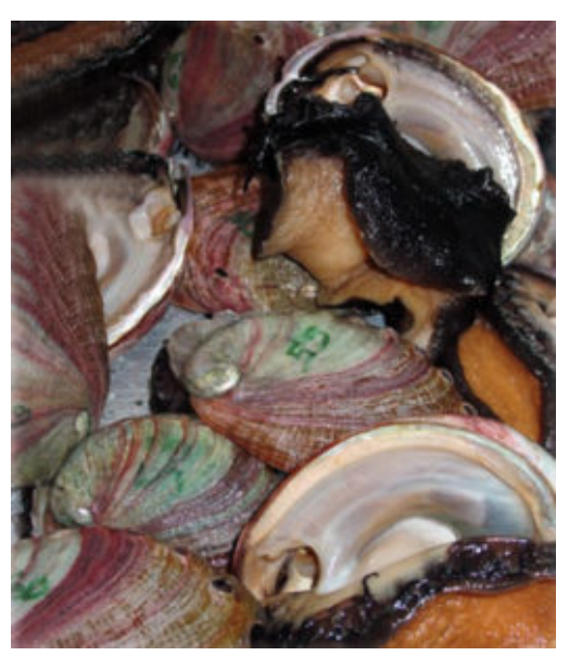
Red abalone breeding programs need to consider total weight and size at first maturity in broodstock selection.

In Mexico, it takes three to four years of culture for an abalone to reach market size of 80-cm shell length and 80gram total weight. Commercial breeding and selection programs that seek to reduce this grow-out time must consider exploiting the biological potential of the species, including whether abalone morphology changes as abalone grow. The use of allometry has been of great value in understanding the way animal shape changes during growth in many species.