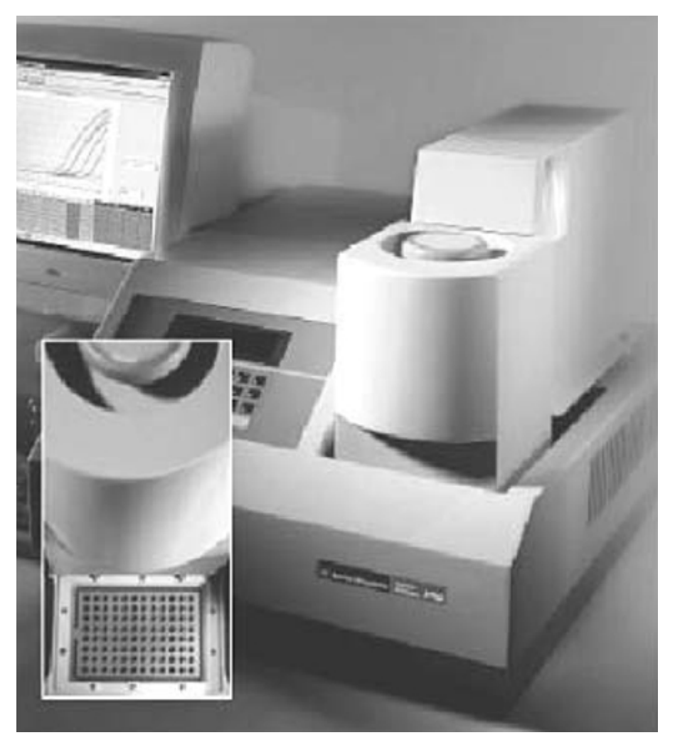
Real-time PCR instrument used in aquaculture pathology Lab at the University of Arizona, USA.

Much research effort has been directed toward the detection and quantification of viral infections in cultured shrimp. Molecular techniques have proven very effective, and determination of the number of viral genomes in infected individuals has become one of the most important means of monitoring the progression of shrimp viral diseases.