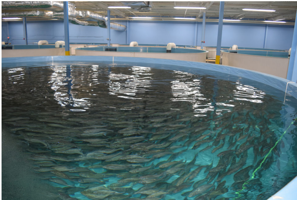
Ideal Fish is a 63,000-square-foot RAS facility producing branzino in Connecticut.

With U.S. land-based aquaculture development booming, new ventures exude confidence