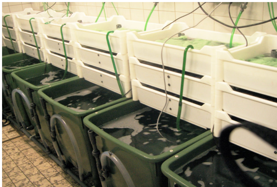
View of the experimental tanks used in the study.

Common carp ( Cyprinus carpio ) juveniles were used as a test model, as this fish species is widely distributed throughout the world, with total annual production of 4.16 million metric tons (MT), and it is ranked as the third-most important cultured fish species worldwide. In this study, there were two treatments: one group of unfed fish (for seven days prior to each sampling) and another group which was fed (2 percent body weight) throughout the study.