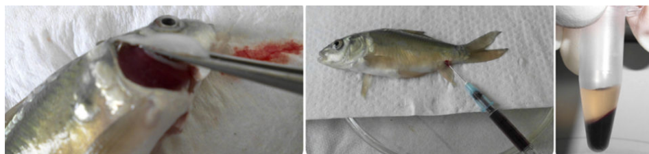
Sampling of gill tissue for Rhesus (Rh) glycoproteins quantification (left); Collection of blood/plasma for body burden of ammonia assay.

Both groups of fish were then exposed to high ammonia (1 mg/L as \text{NH}_3 ) levels at 17 \pm 1 degrees-C and water pH 7.4 for a period of 28 days. We assessed the accumulation of ammonia in blood, ammonia excretion rate and expression pattern of Rh glycoproteins (Rhcg isoforms and Rhbg) in the fish gills. "For additional information on the study setup and experimental design, please refer to Compensatory responses in common carp ( Cyprinus carpio ) under ammonia exposure: Additional effects of feeding and exercise," by Diricx et. al ( https://www.sciencedirect.com/science/article/pii/S0166445X13002142 ).