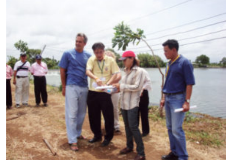
Seafood safety practices must be applied postharvest, as well as throughout the production process.

In general, 11 attributes should be considered when developing a food safety prevention program for an aquaculture farm.