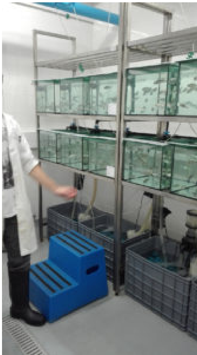
View of the experimental setup used in the study.

The stress challenges were applied three times a week and consisted of brief crowding of fish in one of the aquarium sides (60 seconds). A rectangular-shaped division with 5-mm holes, allowing water to flow through, was used to reduce the available volume to half of it.