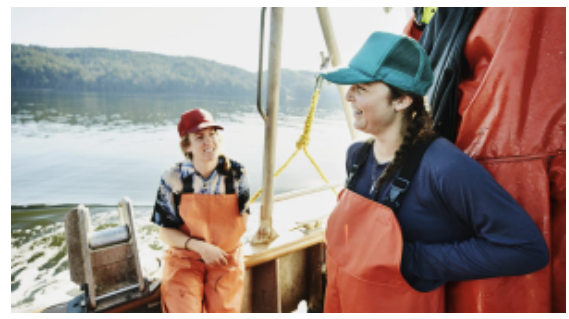
U.S. NGO Environmental Defense Fund polls registered voters and finds that 84 percent would support a well-regulated aquaculture industry.

U.S. non-governmental organization Environmental Defense Fund on Wednesday released the results of a poll of registered American voters that showed the overwhelming majority would support locally grown seafood with strong environmental and consumer protections.