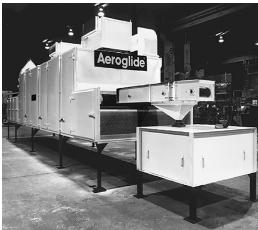
Fig. 2: Horizontal dryer.

Vertical coolers do not require much space, but compaction can occur with soft, moist feeds. Another disadvantage – also present in counterflow coolers and dryers – is that as pellets move in the direction of the flow, they rub against each other, which can generate a significant amount of fines. Excess fines must be screened out and reprocessed, which results in additional work and reduced efficiency for the plant.