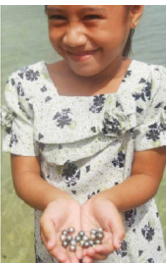
A young girl from Pohnpei proudly displays her community's pearl harvest.

In nearby Palau, aside from the introduction of giant clam hatchery technology, researchers have successfully established a mangrove crab hatchery to supply crablets to local farmers, and are now working to establish a rabbitfish and milkfish hatchery. Resulting production continues to help meet consumer needs as well as replenish natural stocks in lagoons throughout the region.