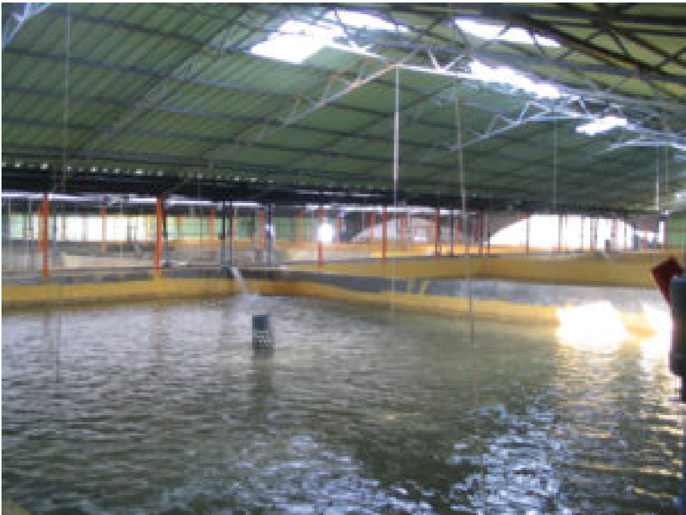
Olive flounder are raised in flow-through systems at land-based facilities on the south and west coasts of Korea.

The Republic of Korea is the top global producer of olive flounder. It produced over 70 percent (42,187 metric tons, or MT) of the global supply in 2005. The second-largest producer was Japan (10,686 MT), followed by Argentina and Uruguay, countries with production from only capture sources (Table 1).