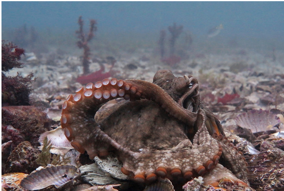
Wild octopus populations are in decline amid growing demand for the species in wealthy nations.