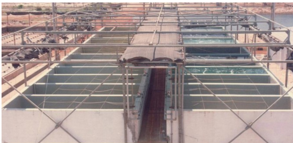
A typical shaded outdoor tank reactor phycosphere, always susceptible to eolian dust.

Carbon dioxide was injected at 0.2 percent (v/v) for higher dry protein content per cell, as 8-mm diameter bubbles that assured a vertical rise-up of whole air cells to break the surface. A tear-drop surface skimmer congregated the extracellular metabolite particulates. As diatoms release extracellular polysaccharides with nitrogen limitation, nutrient dosing was carried out every other day, with actual doses calculated at 50 percent of the culture volume in order to check and control intercellular adhesion and aggregation.