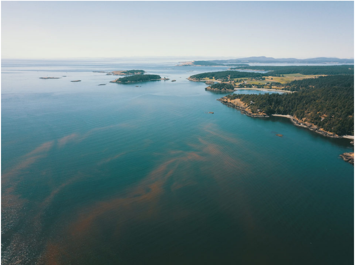
An aerial view of a harmful algal bloom in Washington's San Juan Islands.

The news wasn't welcome. It also wasn't entirely unexpected.