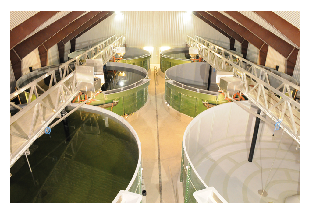
The Fjordsmolt RAS farm will have the capacity to produce 4 million smolts annually. It recirculates 91 percent of the total water flow and utilizes two-step aeration and carbon dioxide flushing to improve water quality.

The production of Atlantic salmon smolts for stocking in sea cages has experienced a dramatic intensification over the last 20 years. While most of this production still takes place in single flowthrough systems, more and more of these farms are introducing partial recirculation of the tanks to remove excess carbon dioxide.