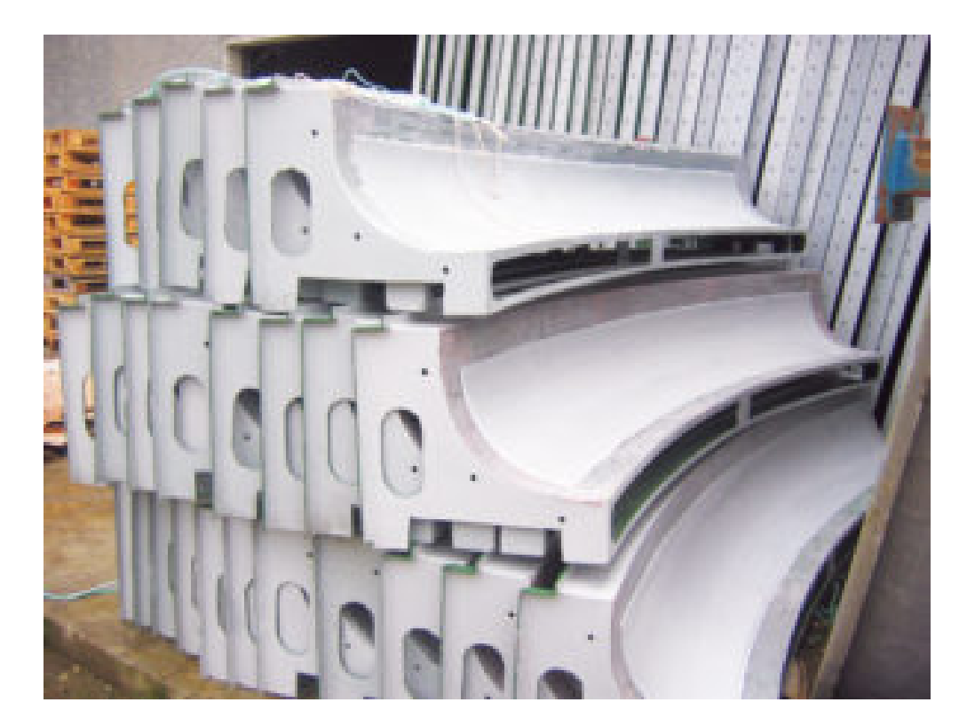
The fiberglass "base panel" sections eased installation of the tanks on site.

2009 print edition of the Global Aquaculture Advocate.)