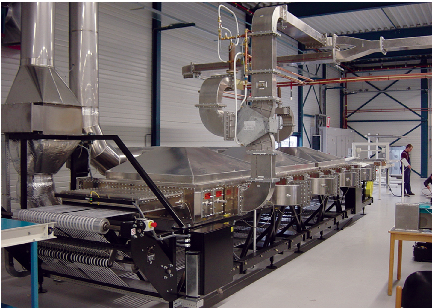
New industrial microwave drying ovens provide more consistent and continuous microwave fields.

Extruded aquaculture feeds are traditionally dried using vertical or horizontal dryers, while pelleted aquafeeds are, in most cases, only dried by evaporative cooling using vertical counterflow or horizontal coolers. Microwave drying and cooking, which have been used for years in household applications for ready-to-eat foods or to warm up precooked food, may also soon find an opportunity in aquafeed manufacturing.