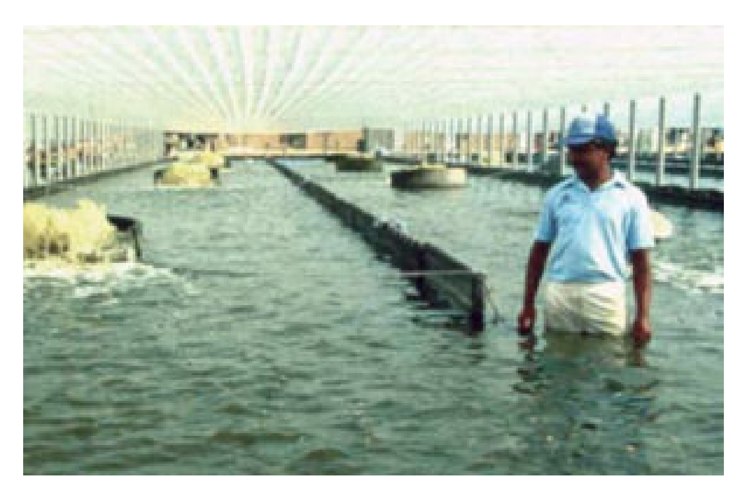
The tilapia fingerling production raceways at Solar AquaFarms used microbial flocs for both water treatment and natural food.