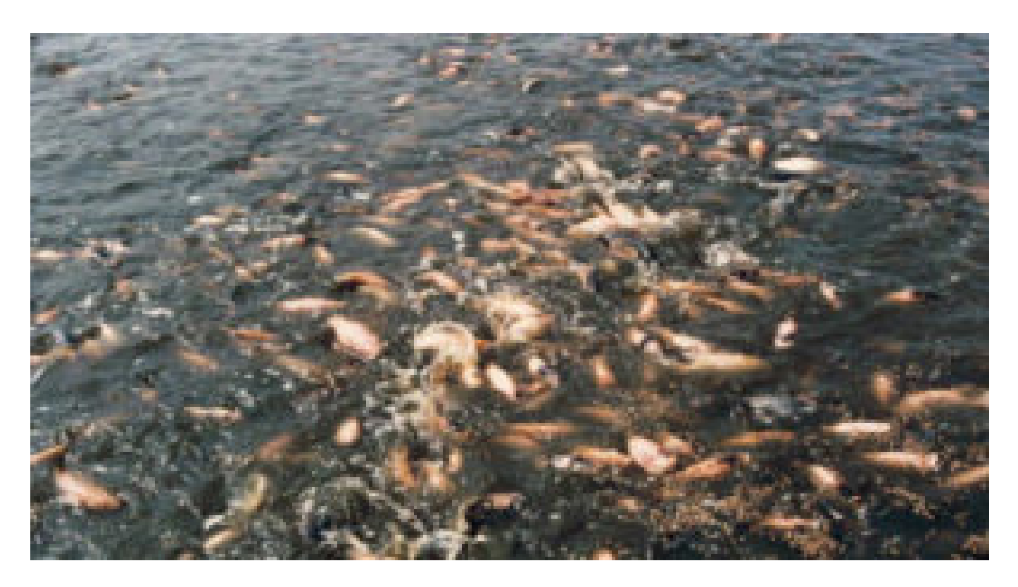
Tilapia were raised in high-density tanks with microbial floc as the sole treatment system at Solar AquaFarms in California, USA.

wastes for use in several beneficial ways.