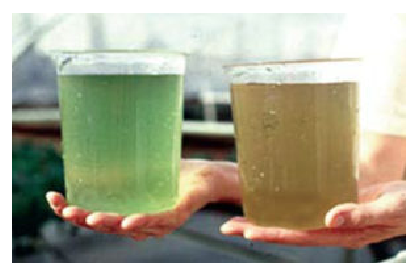
The microbial floc on the right is dominated by bacteria, zooplankton, detritus, and brown algae, while the thin floc on the left is dominated by green algae.