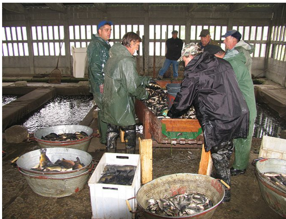
The health-promoting properties of aquatic products, such as these farmed carps in Poland, are an important tool against several lifestyle-related modern diseases.

To strengthen the perception that poor nutrition is the major cause for the pandemics of obesity and its burden of chronic degenerative welfare diseases, the authors listed some very familiar food products from well-known, global operating fast-food companies, highlighting the lack of vitamins and minerals in our daily eaten food, like hamburgers, fried chicken, pizzas and convenience meals.