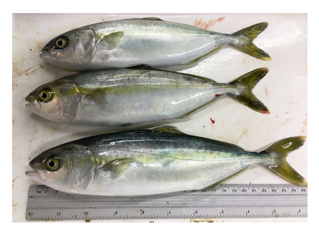
This study evaluated the growth performance and tissue composition of juvenile California yellowtail fed varying dietary levels of various long-chain polyunsaturated fatty acids.

The California yellowtail (Seriola dorsalis, formerly S. lalandi), an important food and sportfish, is an important commercial aguaculture candidate and there is much interest to develop commercial. offshore production operations in the western United States and Mexico. But to achieve this aquaculture potential, production methods must be optimized and sustainable, cost-effective feeds and feeding strategies identified – in particular, research on fishmeal and fish oil sparing is a priority.