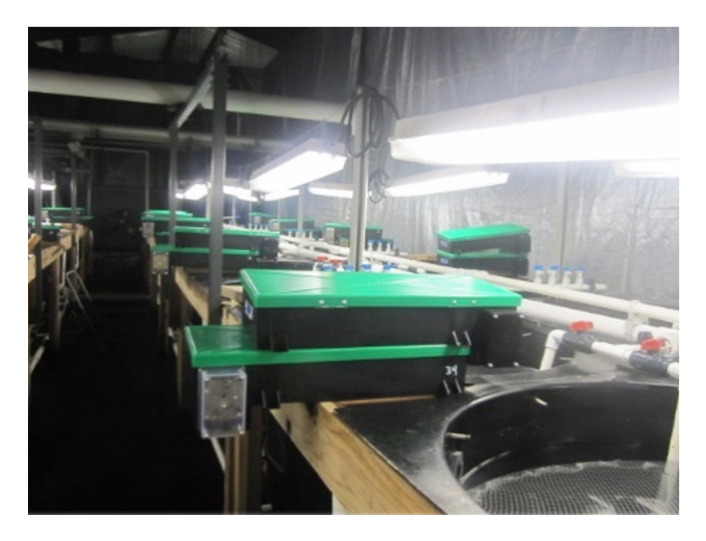
View of experimental tanks and belt feeders used in the study.