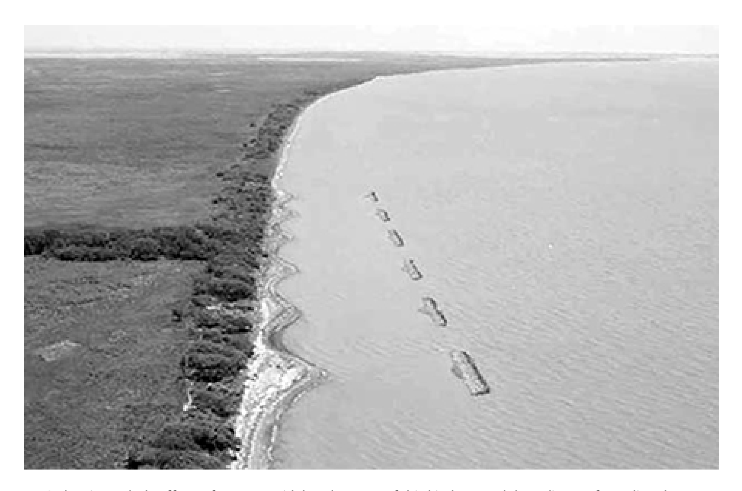
A classic tombolo effect, often seen with breakwaters of this kind, caused the salient to form directly behind the breakwaters on the shoreline at a demonstration project in Vermilion Parish, Louisiana.