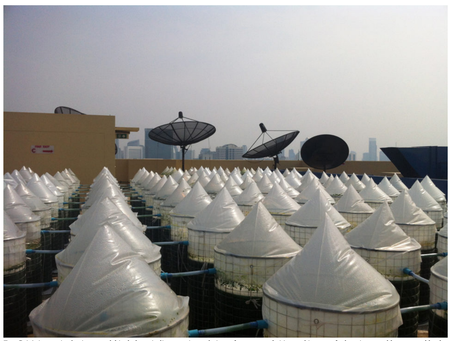
EnerGaia's innovative business model includes spirulina-growing techniques for towns and cities, making use of otherwise unusable space and land, like city rooftops. Courtesy photos.

Saumil Shah has a vision to feed the world with spirulina, a filamentous blue-green microalga packed full of protein, vitamins, minerals and micronutrients. Shah hopes it will become part of everyone's daily diets and make the grade as an affordable alternative protein source in aquaculture feed.