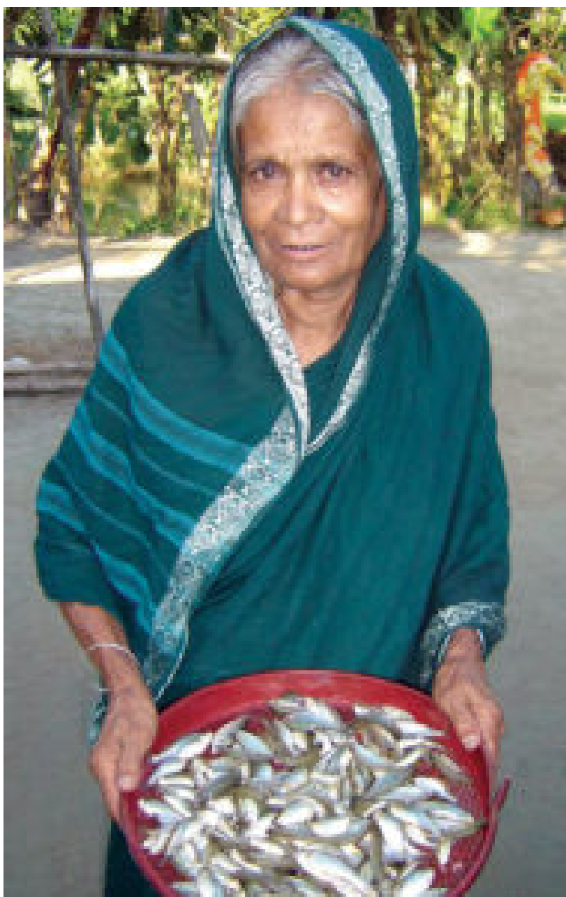
Smaller fish raised in polyculture serve as family food items.

Part of the study evaluated the effects of silver carp and each indigenous food species on pond ecology and the growth, survival, and yield of the large and small fish. Eighteen 100-square-meter experimental ponds at the Mymensingh campus of Bangladesh Agricultural University were stocked with 100 rohu, catla, and common carp, with or without 250 punti or mola. Ten silver carp were also added to half of the ponds.