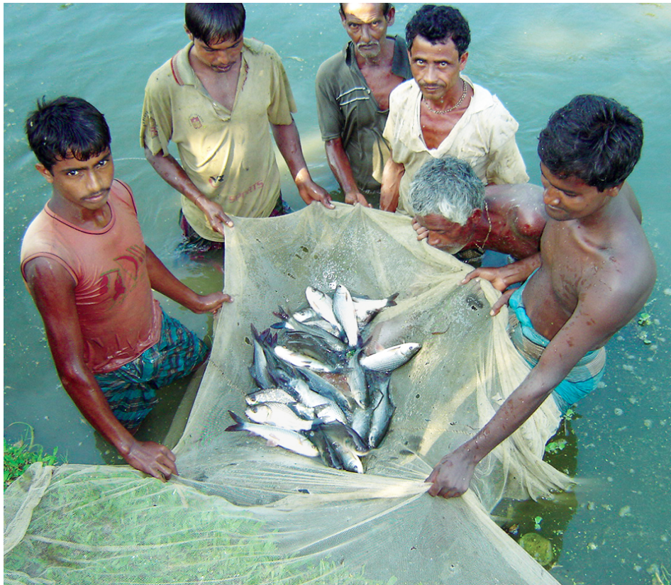
Larger carps provide a cash crop for rural farmers in Bangladesh.

Many of the inland water bodies in Bangladesh are now overfished due to population pressure. With the government's active support, polyculture of Indian major and Chinese carp has been introduced to increase the fish supply. However, the nutritional status of rural people remains low because many farmers grow the fish primarily as cash crops rather than food for their families.