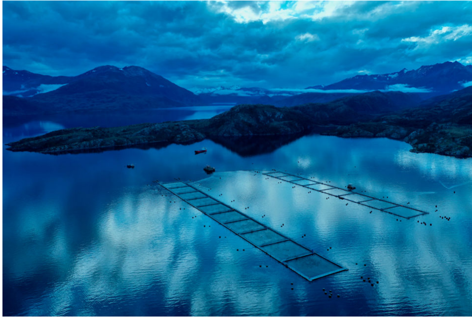
Nuseed worked with partners in Chile to conduct commercial scale trials on Atlantic salmon.

Studies in the field indicate that Nuseed's canola oil can provide a benefit when used in feed, according to Pablo Berner, the company's aquaculture lead in Chile. Nuseed worked with partners to conduct three commercial scale trials in Chile in 2018 and 2019 on Atlantic salmon, the company's initial target market for its product. Each site had 16 to 24 cages, with roughly 40,000 to 50,000 fish in each cage. There were both control and experimental groups of fish.