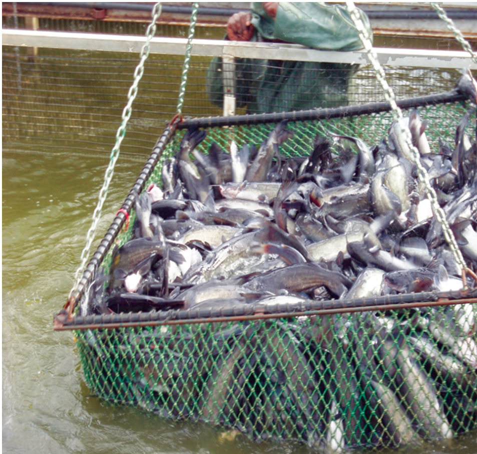
Catfish were harvested throughout the study as they reached marketable sizes.

Channel catfish and hybrid catfish fingerlings were obtained from commercial suppliers and three raceways were stocked with each fish. Upon arrival from the hatcheries, fingerlings were sampled to screen for diseases and estimate initial weights. Once the initial inventory and fingerling acclimation were complete, raceways were stocked at densities ranging 17.67-118.04 kg fish per cubic meter. Individual fish weights ranged 58.9 to 417.3 grams (Table 1).