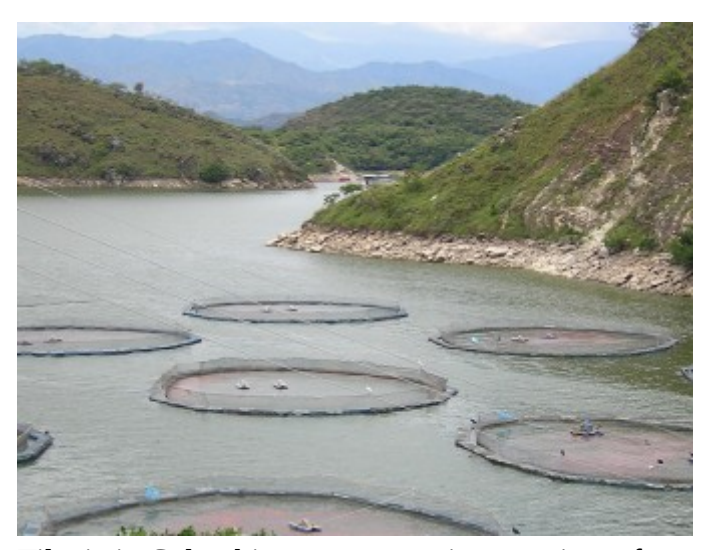
Tilapia in Colombia are grown using a variety of technologies, including round, surface cages like these.

Colombia has taken on challenges to enhance its competitiveness and productivity in the aquaculture sector, which have been led by FEDEACUA — Colombian Federation of Aquaculture (www.fedeacua.org), a national guild formed in 1998 that represents inland fish farming with the production of tilapia, trout, and cachama and other native species. FEDEACUA in his role as a national guild leads the sustainable growth of the activity and develops a prospective of technical work through four technical axes of functional work: AQUASOST, Science and Technology Unit; AQUAGAP TECNIPAB, Technical Assistance Unit; EDUAQUA, Aquaculture School for the Productive Sector; and INFOAQUA, Observatory for the Competitiveness of Fisheries and Aquaculture.