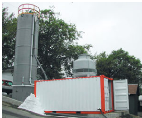
New self-contained mobile systems feature “containerized” ice slurry generation, pumping and controls.

Some of the most challenging demands facing the fish industry are to improve the quality and yield of fish products. Recent publications with the support of microbiological, biochemical and sensorial analyses suggest that ice slurry is a technology that holds promise to achieve those goals for a wide range of fish species.